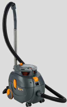
2017 TASKI AERO 8/15