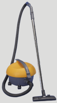
1993 TASKI baby bora