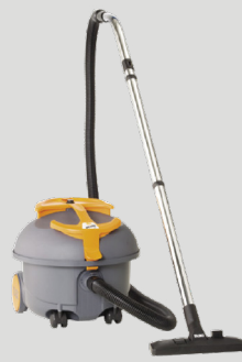
2007 TASKI vento