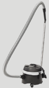
2016 TASKI go