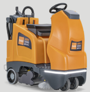
2021 TASKI AERO 3500