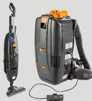
2020 TASKI AERO UP & TASKI AERO BP B PLUS