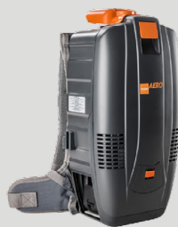
2018 TASKI AERO BP