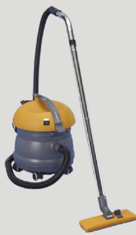
1996 TASKI bora 12