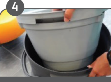
Ensure filters are in place and clean.