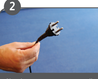
Check equipment, especially plug and cable. Report any fault or damage to a supervisor.