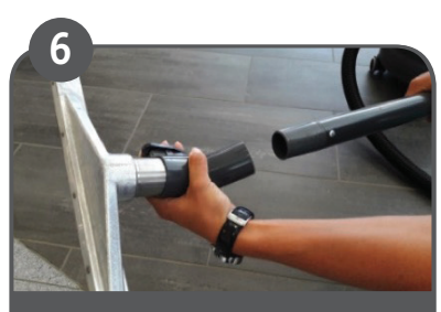
Apply tools to the hose.