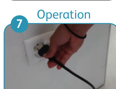
Plug in main cord.