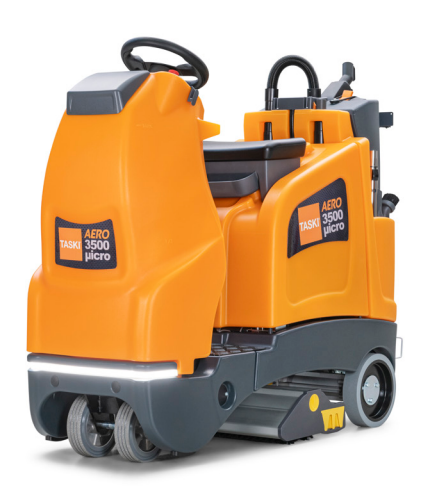
AERO 3500 Ride-on vacuum/sweeper