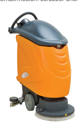
Swingo 755b Small/medium scrubber drier