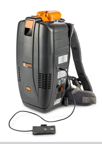
AERO BP Cable and battery backpack vacuum