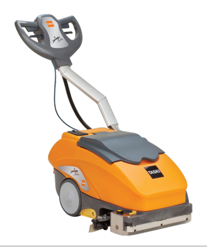
Roller brush and offset for edge cleaning