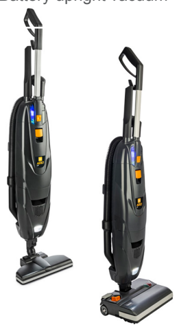
Battery upright vacuum