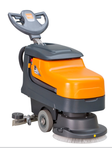
• High productivity 1290m<sup>2</sup>/hr